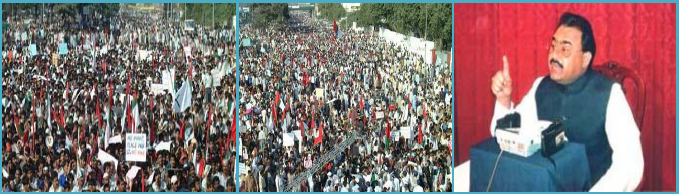
Sept. 26 2001. MQM leader Altaf Hussain addressing a million March Rally against Taliban's terrorism

its workers were killed and it was pushed out of mainstream politics of Pakistan by propagating that it has as a violent past and is extremist party, which MQM has strongly denied.